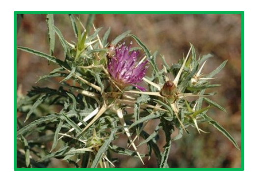
Star thistle (Centaurea calcitrapa).