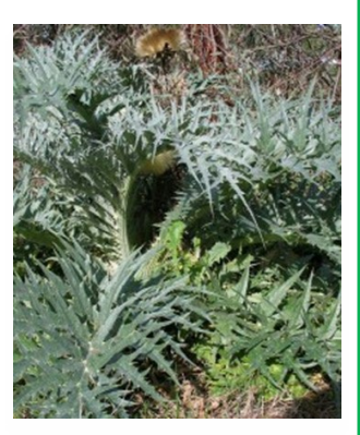
Artichoke thistle (Cynara cardunculatus)