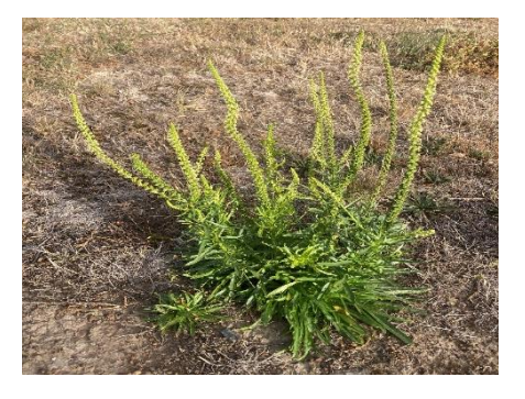
Wild mignonette (Reseda luteola)