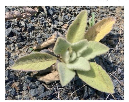
Great mullein seedling (Verbascum Thapsus

You may have noticed a couple of roadside weeds that are really starting to get around the district. Great mullein (also known as Shepherd's blanket, Blanket weed, Mullein, Aaron's rod, Jacob's staff, Shepherd's club, Devil's tobacco, Flannel plant, Hag tamper, Velvet plant, Woolly mullein, Big taper, Hedge taper, Velvet-leaf, Candlewick, Iceleaf) and Wild mignonette (also known as Dyer's rocket, Dyer's weed, Weld, Yellow weed). Both are popping up along roadworks, in drains and culverts, roadside stopovers, road verges and other disturbed sites. Great mullein can grow 1 – 3m high, and it has small yellow flowers clustered towards the top of the spike. Wild mignonette can grow to around 1.5m. Both plants produce copious amounts of seed; Great mullein up to 240,000 seeds per plant, some of which can last 100 years! Neither is a declared weed in Tasmania, but we have enough weeds to deal with in the Southern Midlands, so the last thing we need is more of them. Please check out the weedsAUSTRALIA website for more information on these weeds, including control methods.